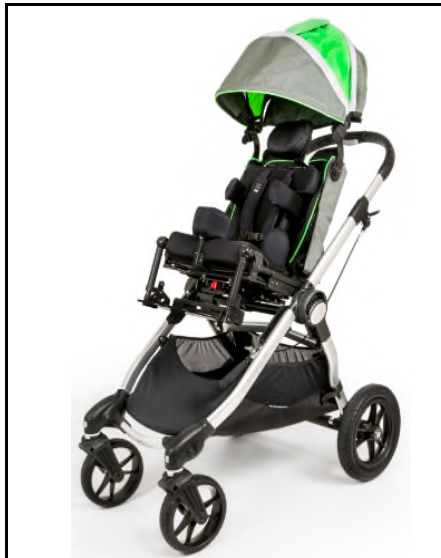
For Advanced Seating See pages 3 and 4