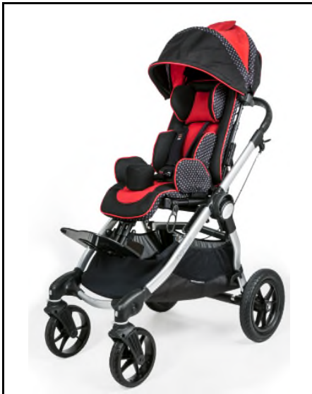
For Moderate Seating See page 2